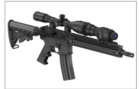
Clip-On (In-Line) Sight

Clip-On Adapter Required, Scope Adapter Optional (Configuration-Dependent)